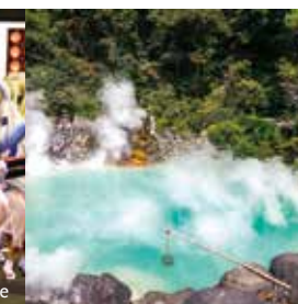
Beppu Hot Spring