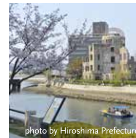
Atomic Bomb Dome