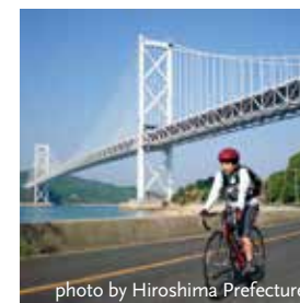
Shimanami Kaido Cycling