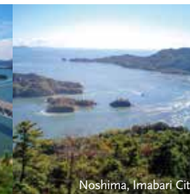
Small and Large Islands