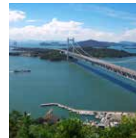
Seto Ohashi Bridge