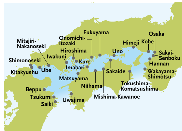
Major ports in Setouchi

Setouchi allows a visitor to appreciate a range of Japanese cultural experiences from some of the best hot springs, sake breweries, and dining establishments offering fresh local food. Setouchi is connected by a network of numerous cruise ships, and tourists can enjoy outdoor activities such as sea kayaking, cycling, and other pursuits in the natural surroundings of the island.